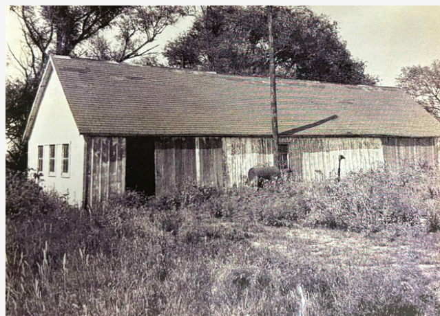
Von Ruden was founded in 1946 in a small shed in Claremount, Minnesota.